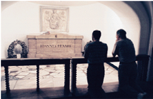
In a grotto beneath the ground floor, pilgrims pray at the tomb of John XXIII

Peter is imperfect, as are all the apostles, and Jesus certainly knows about this. In fact, he even predicts that Peter will deny him. At the same time, Jesus promises his special help. "I have prayed for you that your faith may not fail;" he tells Peter, "and when you have turned again, strengthen your brethren" (Lk 22:32). This is Peter's role. Strengthened by Jesus, he strengthens the other apostles and helps maintain their unity. He serves us all by using his authority to bring us to the kingdom. As one of his titles puts it, the pope is truly "the servant of the servants of God."